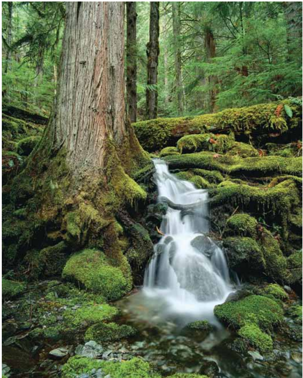
Photo above - Cathedral Grove on Vancouver Island, B.C.