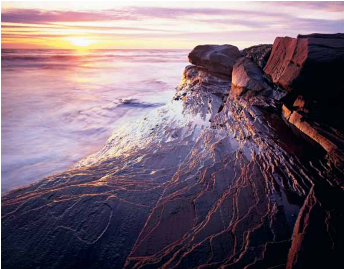
Photo at left - Canoe Cove, P.E.I.

same type of camera used by photographer Ansel Adams at the turn of the last century. With this camera he catches nature on large 8 x 10 negatives that provide proofs which are clearer than digital cameras can manage today. He finds that film has an organic property to it; it's finite, no taking an endless ream of shots. Every sheet of film is a labour of love producing that one single image of connection to nature.